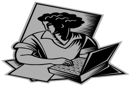
Caption describing pic-

The Eastpointe Memorial Library is proud to present programs to the youth of Eastpointe.